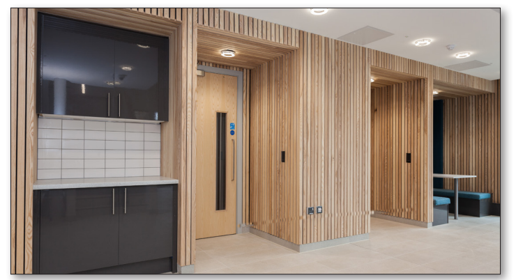
Above: Wolfson Centre - Bradford Royal Infirmary

We are able to assist with the specification, design, material sourcing, build and fixing for any project where cladding, facades and acoustic panelling is required.