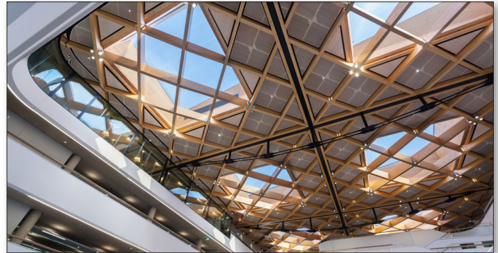
Above: Acoustic ceiling panels - Warwick University