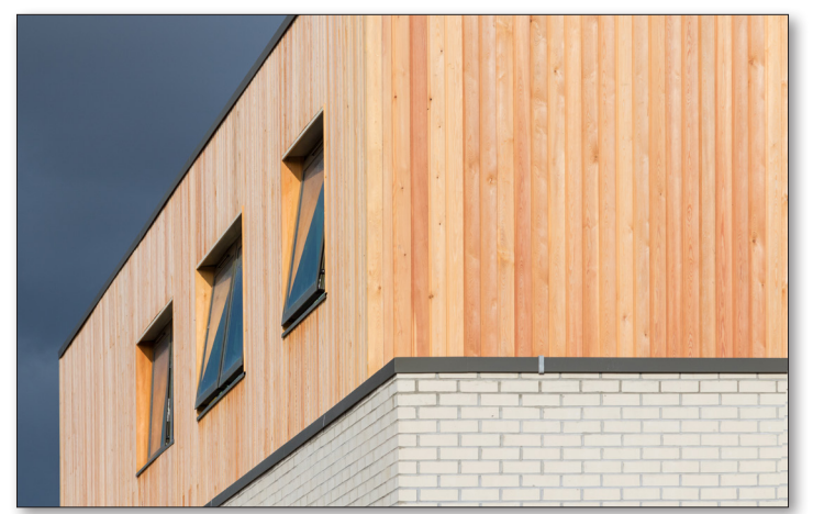
Above: Lincoln Court - York City Council