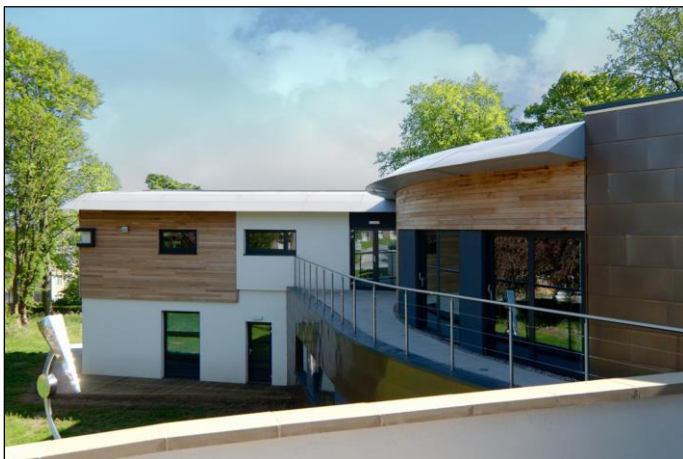
Above: Temple Bank House - Bradford Hospital